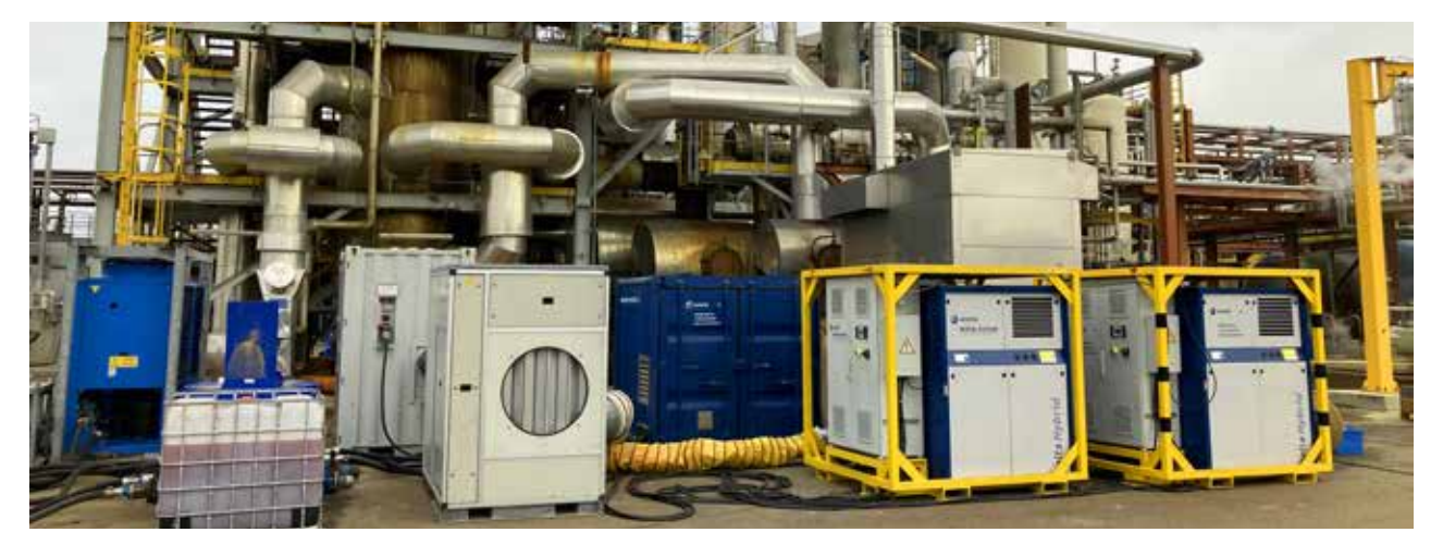
We are an application specialist and do not only rent blowers and compressors, but also all accessories required to fully integrate the rental solution into your production process to save productivity.

If you maintain production for only a few weeks or a few months each year, Aerzen Rental is always close by and stands ready to support you. We can set up temporary waste water treatment systems to allow you treat the excess during seasonal demands, like harvest and touristic seasons. Sugar fabric, waste water plants in wine or touristics areas have already trusted Aerzen Rental to meet their increase of capacity during their peak of production.